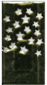
Special Gold Luminaria Bag Minimum $25.00 donation

Additional luminaria will be available for purchase at Relay, prior to the Luminaria Remember Ceremony.